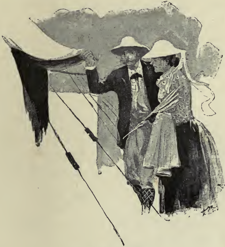
HE LIFTED THE FLAP.

hampton it would be completely out of date, and not even a black silk will cut to any great advantage twice.